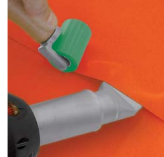
Tarpaulin processing: 40 mm roller