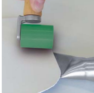
Roof application: 40 mm and 28 mm roller