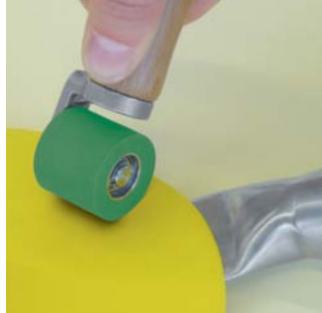
Civil engineering application: 40 mm and 28 mm roller